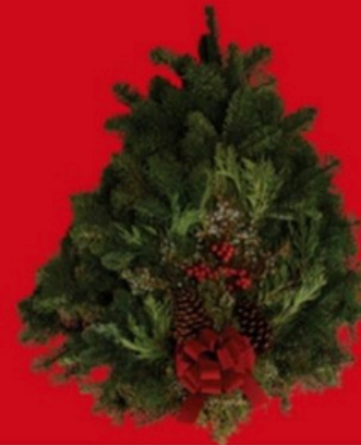
25" Swag w/ Holly Berries