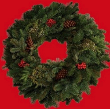
22" Mixed Noble Wreath w/ Pinecones & Holly Berries

These wreath and swag options would make a great statement in your home, offering to friends, family, neighbors or gifting!